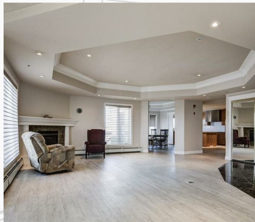
View from bar area