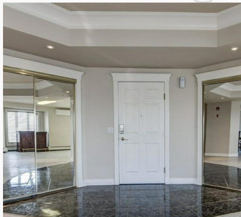
Entry and double closets