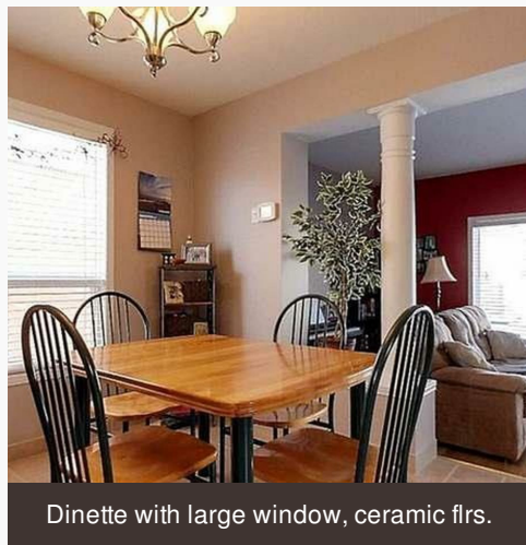
Dinette with large window, ceramic flrs.