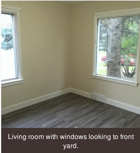
Living room with windows looking to front yard.