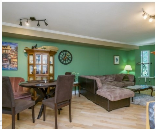
Spacious Great room, Living room and dining room