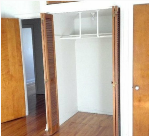
Main Bedroom, Closet, Bathroom